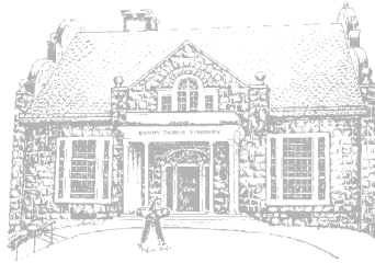
Harcourt Wood Memorial Established 1902